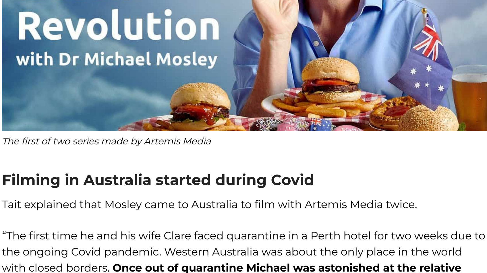
The first of two series made by Artemis Media

"The second series was Australia's Sleep Revolution with Dr Michael Mosley . We partnered with the brilliant team at the Adelaide Institute for Sleep Health at Flinders University, instigating a ground-breaking sleep trial."